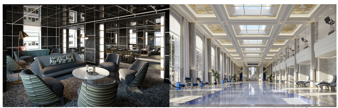
The modern business center boasts a striking design. Noë & Associates/The Boundary