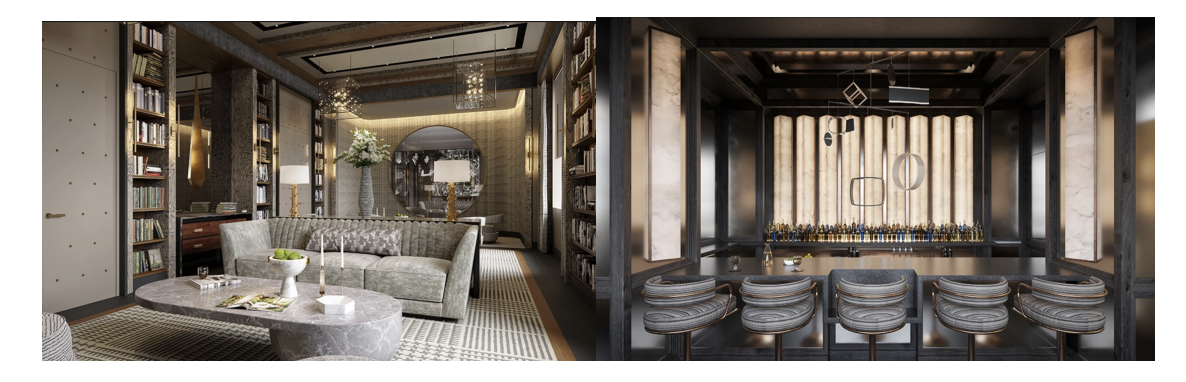
The welcoming presidential library. Noë & Associates/The Boundary