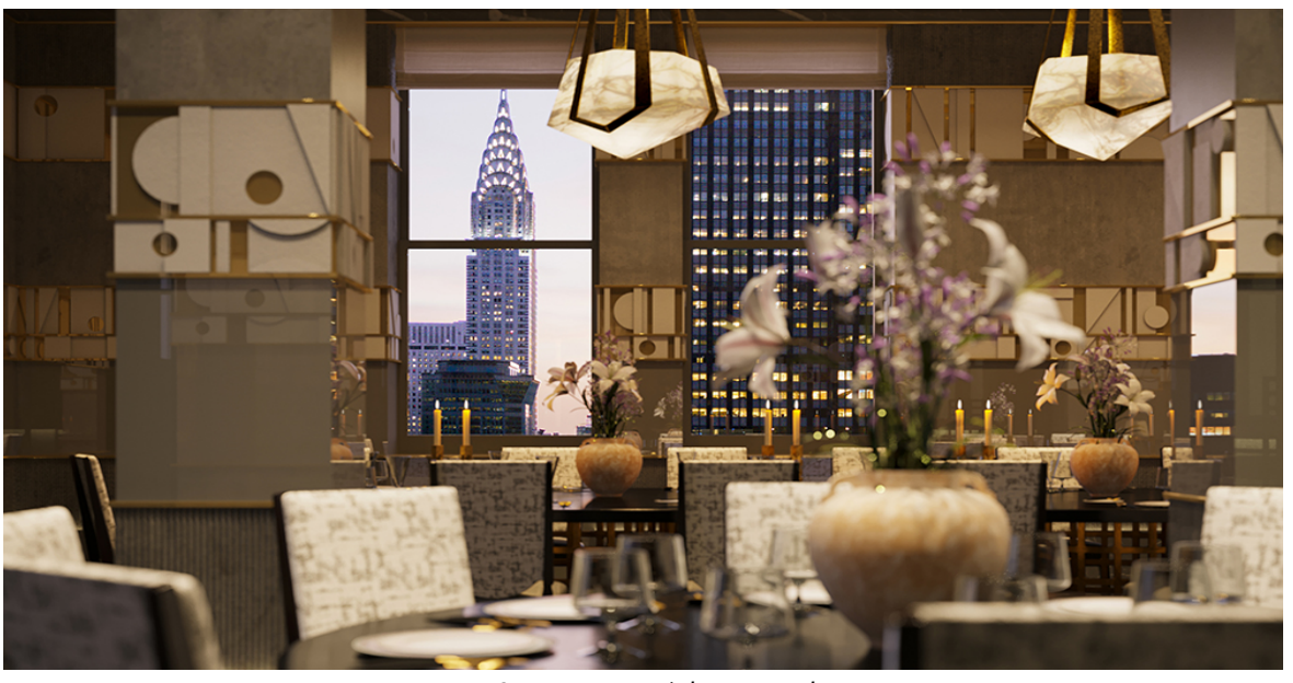
Noë & Associates/The Boundary

By Demetrius Simms Impression: 2,600,000