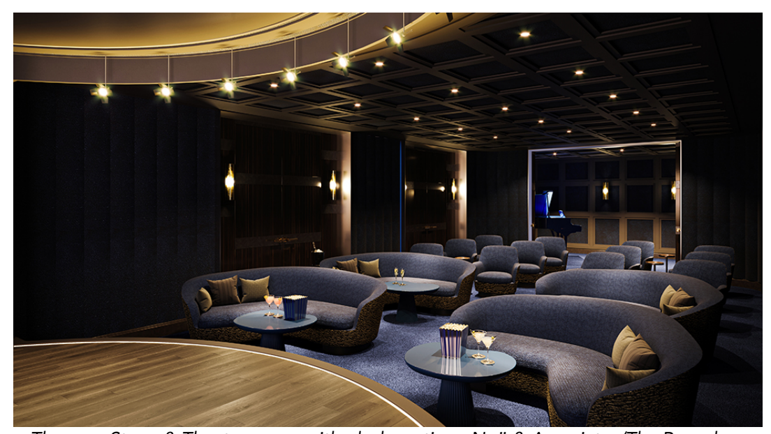
The cozy Stage & Theater space with plush seating.

The new private dining room, dubbed the Chrysler Room, can seat up to 20 people, where you and your guests will find striking views of the Chrysler Building across the way. Custom lighting, also designed by Deniot, will accent the dining space in addition to white-oak flooring and modern designs that trail its ceilings and walls in gold.