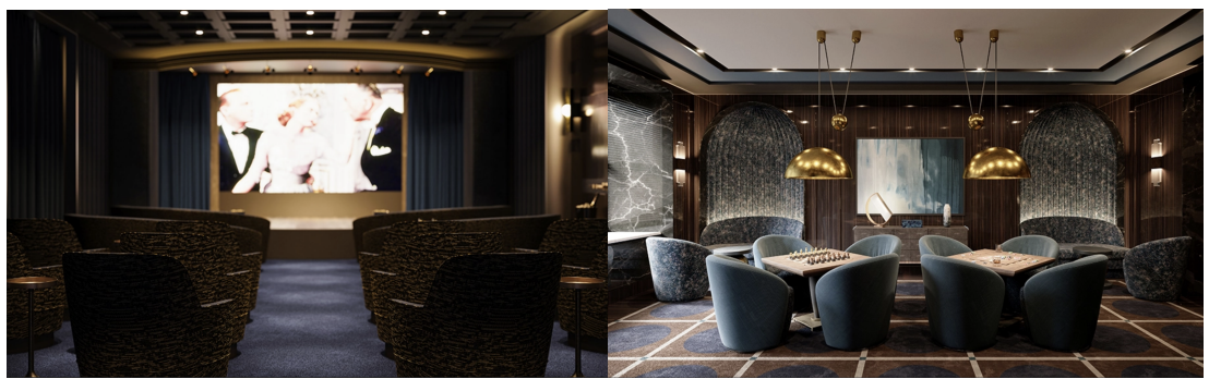
A look at the large theater screen. available to residents.