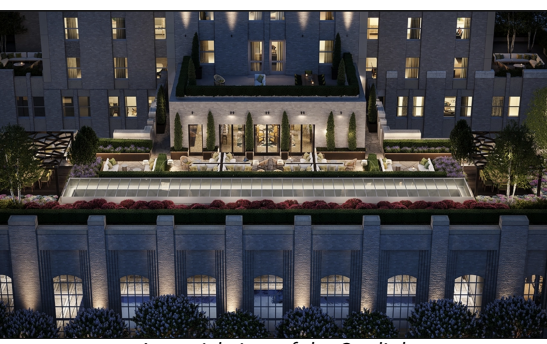
An aerial view of the Starlight terrace.

https://robbreport.com/shelter/home-design/gallery/towers-of-waldorf-astoria-in-photos-1234736834/wany_starlightterrace/?post_type=pmc-gallery&p=1234736834&preview=true