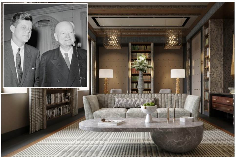
All booked up: The Waldorf has hosted numerous presidents including JFK and Herbert Hoover (inset). Now, it's getting a White House Historical Association-backed rotating reading library.