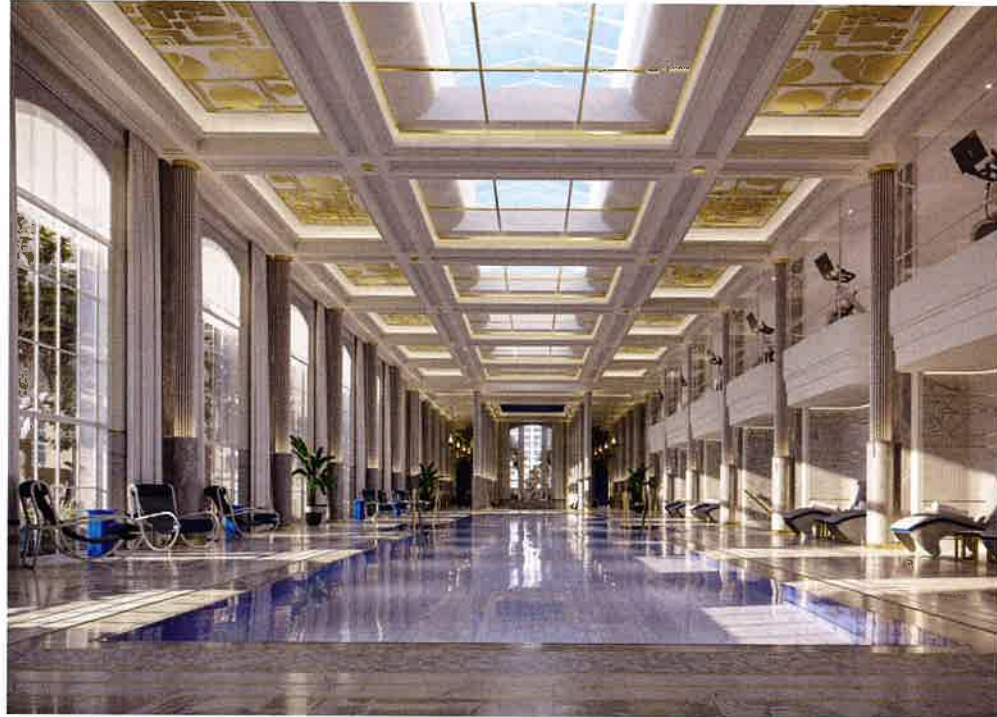
Designed by Jean-Louis Denoit, The Towers of Waldorf Astoria's private amenities will feature a large wellness facility, complete with its own treatment rooms, gym and a spectacular 25m swimming pool overlooking Park Avenue.

apartment, with a marble reception area, provided an impression of what to expect. Each residence will feature solid custom-panelled doors and be fitted with bespoke antique hardware. Bathrooms will feature custom cabinets manufactured by Molenti&C and vanities topped with polished marble. While there will be bespoke elements throughout each apartment, the general design is fixed — so yours will be a quartzite countertop kitchen whether you want one or not.