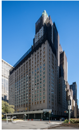
Southwest corner from Park Avenue.

Window replacement is underway at the Waldorf Astoria, the storied 1931 landmark hotel and residence in Midtown that is undergoing an unprecedented renovation. Skidmore, Owings & Merrill (SOM) is leading the renovation of the Art Deco structure, which includes the replacement of 5,356 windows on the building's facade. Over the years most of the original windows had been replaced with windows that reduced the amount of glazing. The current renovation will install new windows based on the original 1931 design, increasing the glazing and daylight by 22 percent. As part of the window replacement, 857 windows will be enlarged.