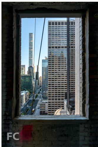
Window opening in preparation for new window installation.