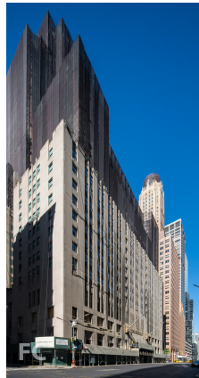
Southeast corner from Lexington Avenue.

When the renovation is complete, currently projected for 2022, the development will offer 375 residences ranging in size from studios to penthouses. Residents will have access to over 50,000 square feet of private residential amenities and 100,000 square feet of hotel amenities. The arrival experience will include a private porte cochere featuring double height vaulted ceilings and two entry lobbies.