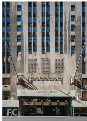
East facade from Lexington Avenue.