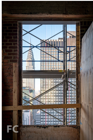
Window opening in preparation for new window installation.