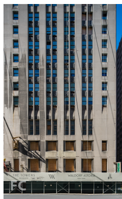
East facade from Lexington Avenue.