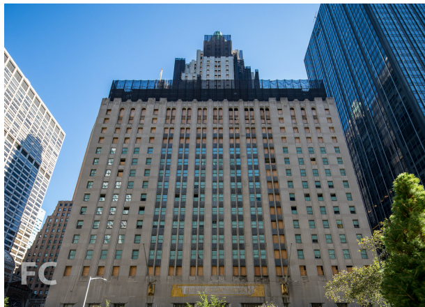
Looking up at the west facade from Park Avenue.

Window replacement is underway at the Waldorf Astoria, the storied 1931 landmark hotel and residence in Midtown that is undergoing an unprecedented renovation. Skidmore, Owings & Merrill (SOM) is leading the renovation of the Art Deco structure, which includes the replacement of 5,356 windows on the building's facade. Over the years most of the original windows had been replaced with windows that reduced the amount of glazing. The current renovation will install new windows based on the original 1931 design, increasing the glazing and daylight by 22 percent. As part of the window replacement, 857 windows will be enlarged.