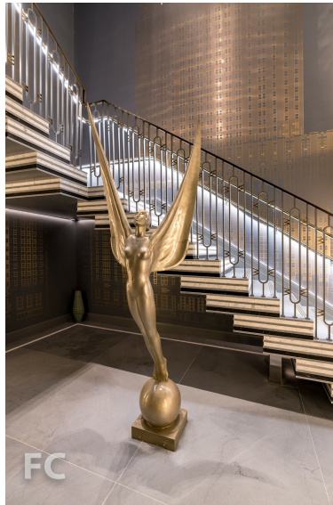
Spirit of Achievement statue in the sales gallery.