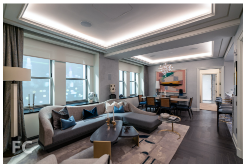
Living and dining room inside the model residence at the sales gallery.