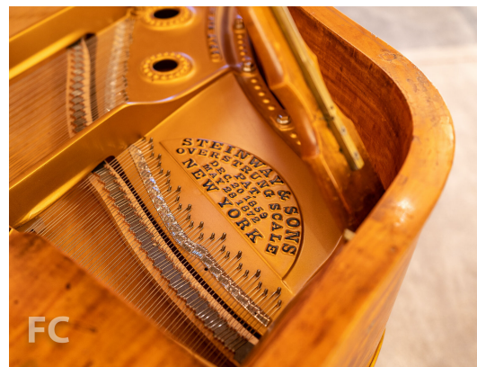
Cole Porter's 1907 Steinway piano in the lobby of the sales gallery.