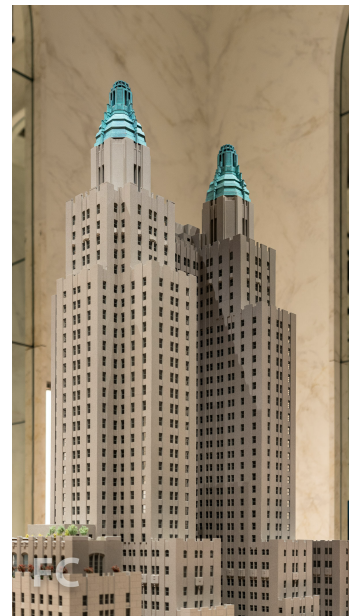
Architectural model of the renovation.