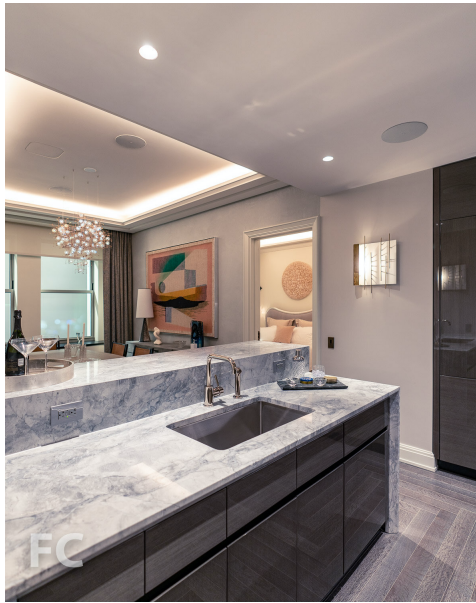
Kitchen inside the model residence at the sales gallery.