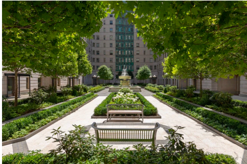
The Belnord courtyard has been winterized.