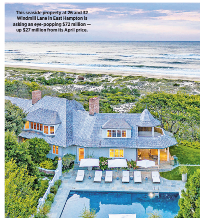
This seaside property at 26 and 32 Windmill Lane in East Hampton is asking an eye-popping $72 million — up $27 million from its April price.

The red-hot residential sales scene is also enticing properties to make their debut. The 10,500-square-foot, seven-bedroom, seven-bathroom mansion at 28 Halsey Ave. in Westhampton has hit the market for the first time. It's asking $9 million with Enzo Morabito of Douglas Elliman. The property boasts a deep-water dock with boat slip, a water-facing gunite pool, a spa, a sunken tennis court and landscaping by renowned designer Edmund Hollander. Welcome to the new normal.