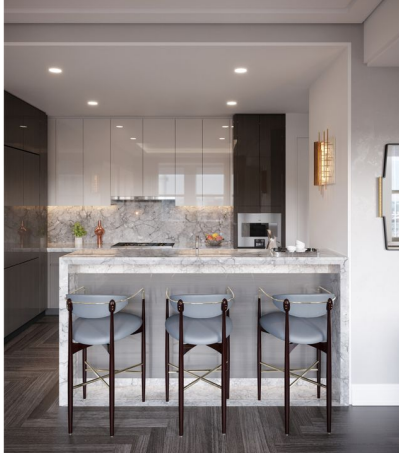
The open kitchen features a peninsula with a bar-height counter and seating area.