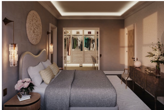
A view of the primary bedroom.