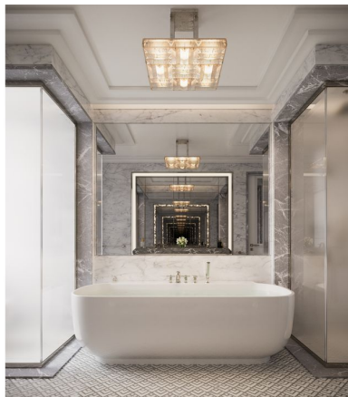
The five-fixture primary bathroom features floor-to-ceiling honed white Mont Blanc marble slab walls and a radiant-heated custom mosaic marble tile floor.