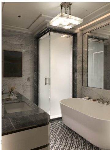
A master bathroom.