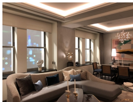
A living room.