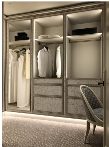
A walk-in closet.