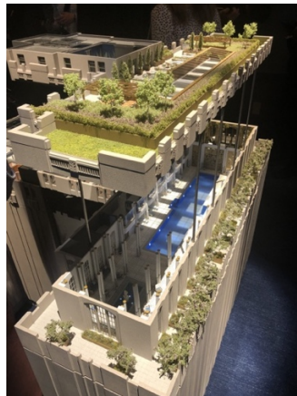
The model partially lifting up to reveal the indoor swimming pool