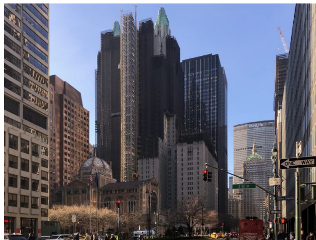
The Waldorf Astoria

Y IMBY recently toured the sales gallery for the upcoming partial residential conversion of the Waldorf Astoria. Dubbed The Towers of The Waldorf Astoria, the project will create 375 residences ranging from studios to penthouses. Addressed 303 Park Avenue, the 625-foot-tall Art Deco landmark was built by Schultze and Weaver in 1931 and is currently undergoing a major restoration that also includes the renovation of 375 hotel rooms.