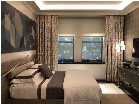
A bedroom.