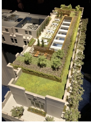
The landscaped outdoor terrace