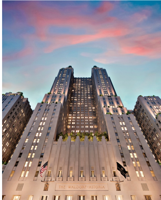
The Waldorf Astoria in New York is undergoing a $1 billion renovation.