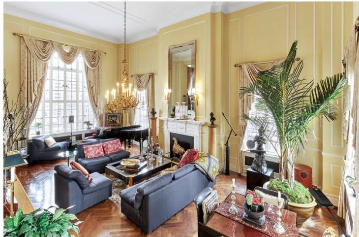
This $4.5 million residence at the Carlyle is on the market with Sotheby's.