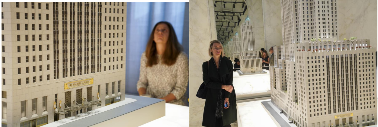
A guest looks at a model of the hotel Waldorf Astoria New York during a press tour in New York, the United States, on March 3, 2020. The historic luxury hotel Waldorf Astoria New York on Wednesday formally started the sales of its luxury condominium residences The Towers of the Waldorf Astoria. (Xinhua/Wang Ying)

http://www.xinhuanet.com/english/2020-03/05/c_138844043.htm