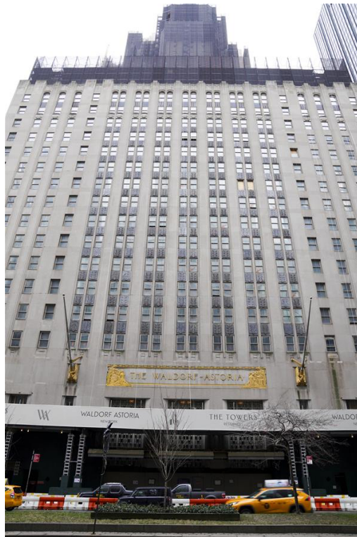
The Waldorf Astoria New York is under renovation in New York, the United States, on March 3, 2020. The historic luxury hotel Waldorf Astoria New York on Wednesday formally started the sales of its luxury condominium residences The Towers of the Waldorf Astoria.

Dajia Insurance Group recently launched a website dedicated to The Towers of the Waldorf Astoria allowing people to browse presentations and make inquiries on line.