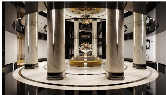
The building is being updated with a contemporary design that honours its history