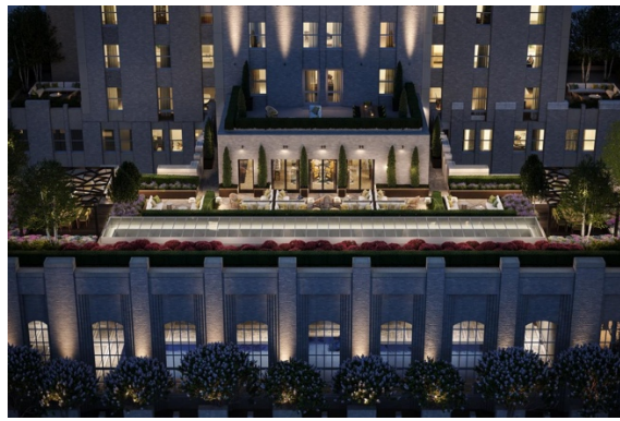
The Starlight Terrace will provide views of the surrounding area