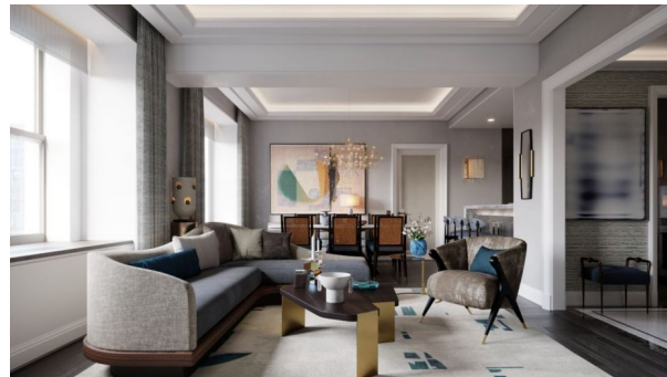
A living room in one of the Waldorf Astoria's renovated condominiums.

The homes' interiors and amenities were designed by Jean-Louis Deniot. The details include custom paneled doors with antique bronze hardware, custom cabinets imported from Italy and tile mosaics with a pattern inspired by the Waldorf Astoria's Art Deco history. Most of the homes have 10-foot ceilings, while some on the upper floors have 13-foot ceilings.