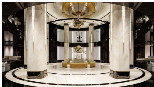
The residential lobby