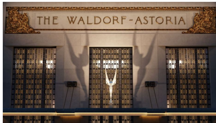
The Waldorf Astoria's Park Avenue facade

The developer behind the renovation of the historic Waldorf Astoria opened up sales of the building's condo units Wednesday.