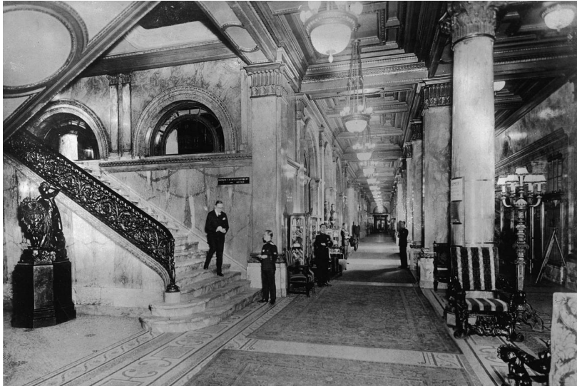
Peacock Alley, the corridor that linked the original Waldorf with the original Astoria hotels. It became a popular place to see and be seen.