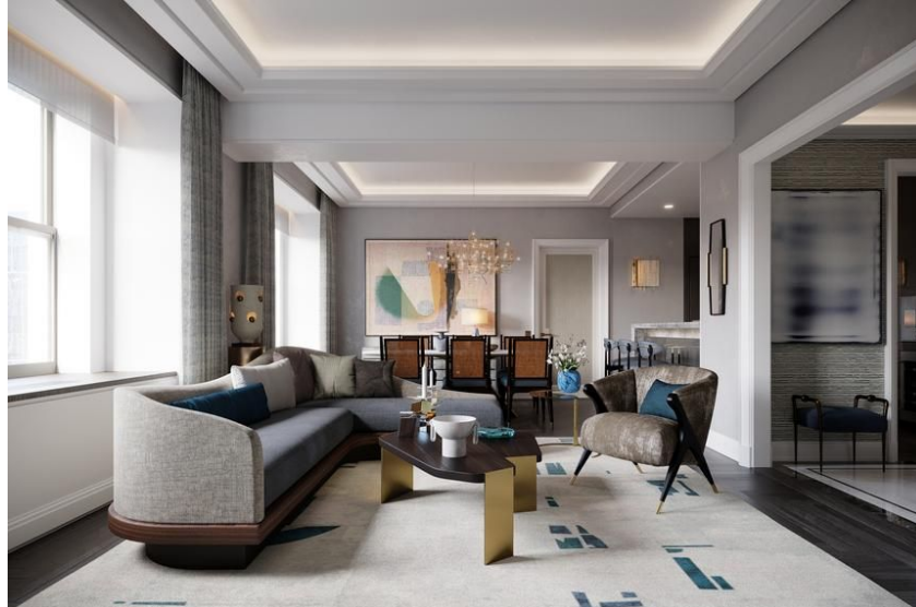
A model unit for the new residences.

launch, the hotel had to endure the Great Depression. At one point in 1932, it had 1,600 people on its payroll but just 260 registered guests. It later recovered with aplomb, going on to host presidents, foreign dignitaries and Hollywood stars.