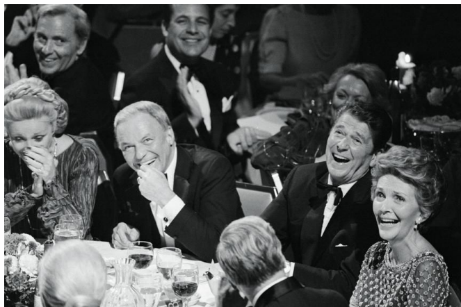
Frank Sinatra with Ronald and Nancy Reagan at a Republican fundraising dinner in the hotel in October 1980.