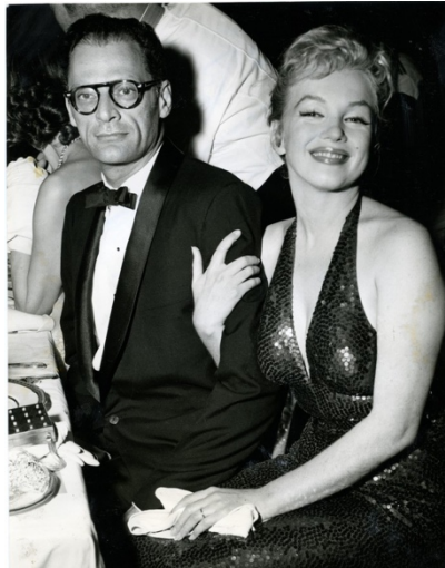
Marilyn Monroe and Arthur Miller at the Ball

Jacqueline and John F. Kennedy are pictured attending an April in Paris themed ball at the hotel in 1957.