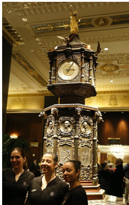
Waldorf Astoria hotel staffers in front of the famous lobby clock, in 2017. The clock, commissioned by Queen Victoria for the 1893 World's Fair in Chicago, will be restored and re-installed when the hotel opens.

Industry insiders say Anbang's strategy speaks to the Waldorf's anticipated appeal to foreign pied-à-terre buyers. Those efforts, however, may be hindered by the U.S. and China trade dispute, which has some Chinese buyers sitting on the sidelines.