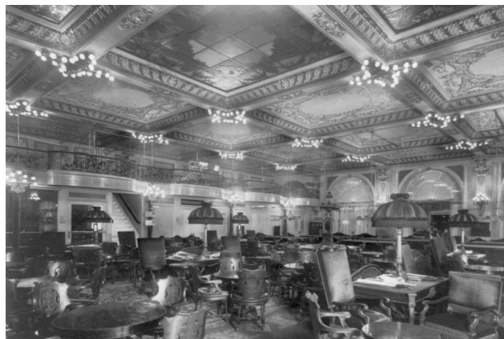
A billiards room in the original Waldorf-Astoria.