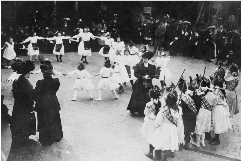
Children play on the roof of the Fifth Avenue hotel.