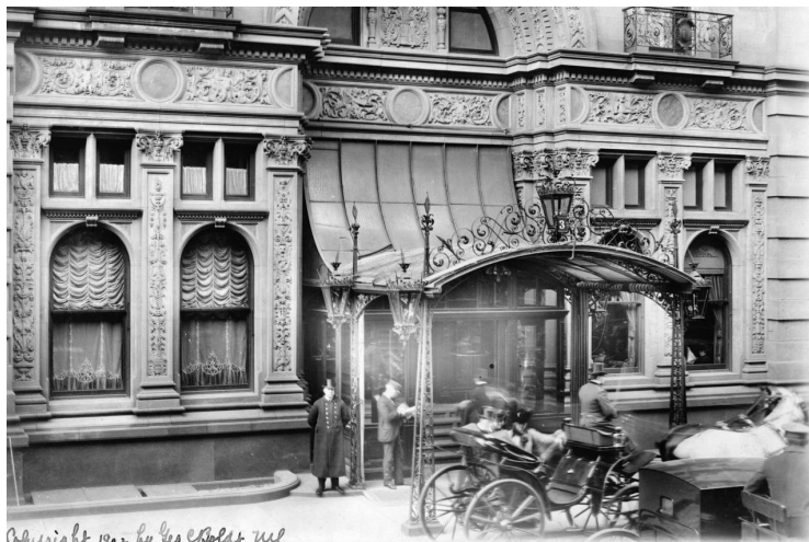
The 33rd Street entrance to the original hotel. A horse-drawn carriage sits in front.