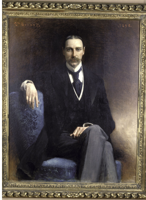
John Jacob Astor IV Dies

John Jacob Astor IV died in the sinking of the Titanic. He was widely thought to have been the ship's richest passenger.