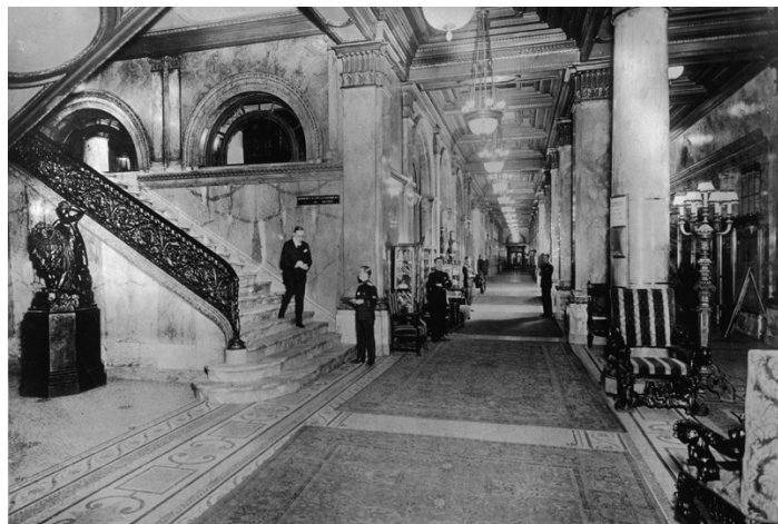
The Original Waldorf-Astoria Closes

John Jacob Astor IV died in the sinking of the Titanic. He was widely thought to have been the ship's richest passenger.