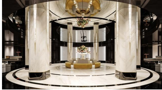
A rendering of the residential lobby.

Residents will use two private entrances to the building, including one with a private porte cochère, and separate elevators. A concealed concierge closet that locks from two sides will be installed in every apartment so staff can drop off packages unseen.