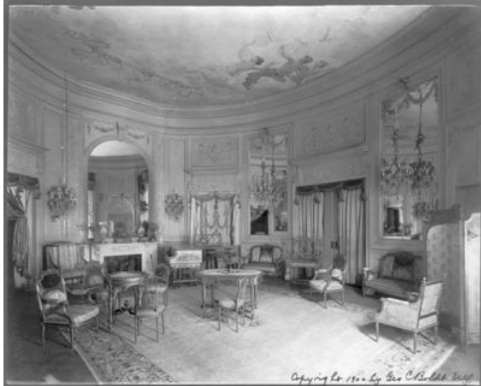
A salon in the original Waldorf, known as the Marie Antoinette Room.