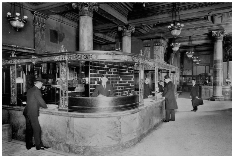
The lobby of the original Waldorf-Astoria.