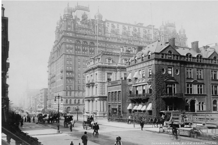
The original Waldorf-Astoria Hotel on Fifth Avenue.