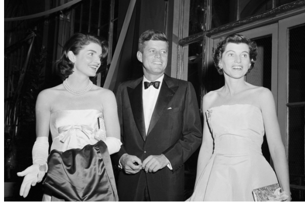
Jacqueline & John F. Kennedy attend the April in Paris ball

Jacqueline and John F. Kennedy are pictured attending an April in Paris themed ball at the hotel in 1957.