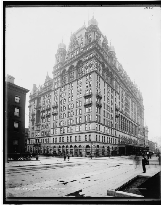
The original Waldorf-Astoria, which has since been razed and replaced with the Empire State Building.